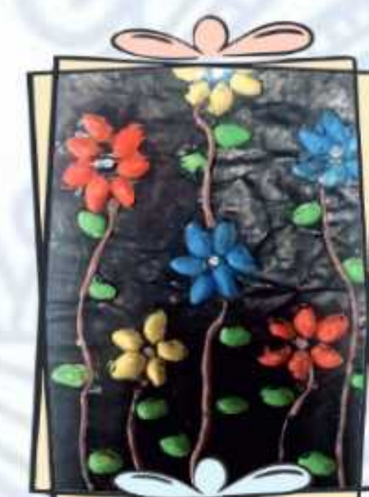
Nivisha Shukla, 3A